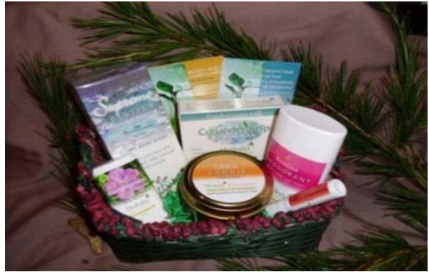
The intense product and market knowledge of small business owners is one of their greatest strengths.

Competition based on lower costs from Thailand, China, and other countries